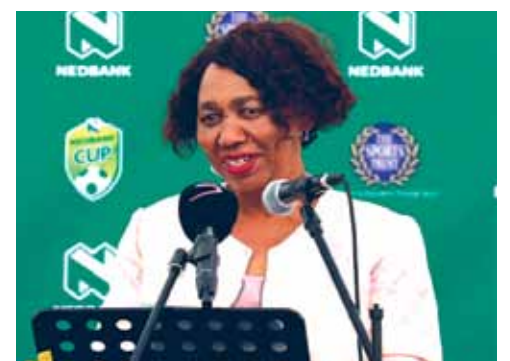
Basic Education Minister Angie Motshekga applauded Nedbank for donating sporting facilities to rural based schools in the country.

times of Covid-19. This donation comes at a perfect time after the lifting of the suspension of school sports as I announced last month. Our children can now fully utilize and enjoy these facilities, of course under the prevailing Covid-19 protocols of no spectators, wearing of masks, regular hand-washing, sanitizing and social distancing," said Basic Education Minister Motshekga. Through the Nedbank Cup, Nedbank's partnership with the PSL continues to make an impact in local soccer, inspiring up and coming players through initiatives such as the multipurpose sports court. "The multipurpose sports court is a suitable vehicle to enhance education through sport for our youth in South Africa, and we are proud to partner with Nedbank to bring these worldclass facilities to communities," said Anita Mathews, Executive Director at The Sports Trust.