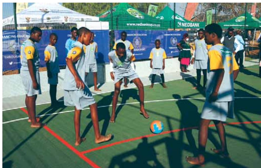
Nkgonyeletse Secondary School pupils demonstrating a five-a-side football match on the newly donated multi-purpose sports facility.