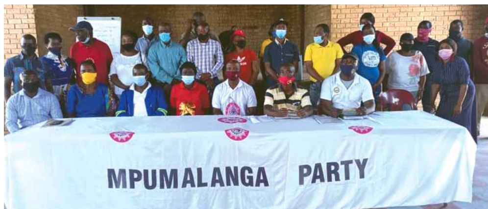
Mpumalanga Party members after electing the new executive committee structure.